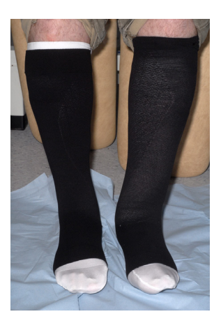
Figures 1a–b. Examples of good fit in compression hosiery