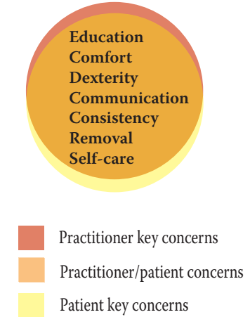
Figure 1. Challenges in compression hosiery